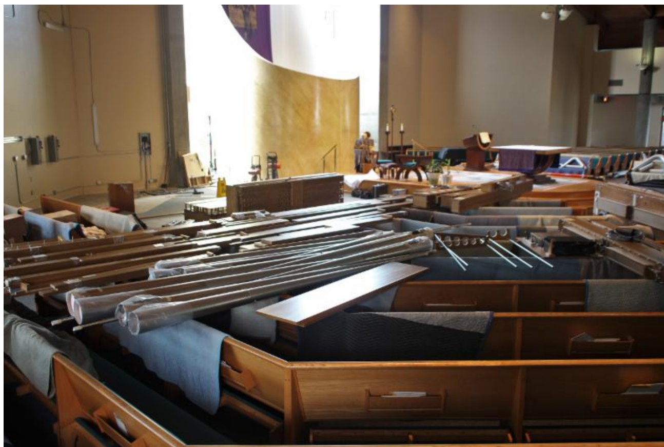
Organ pieces spread throughout the Church in preparation for assembly.